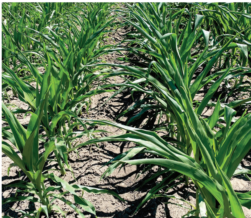
Some biostimulants are foliar-applied to help crops tolerate abiotic stresses such as extreme temperatures or drought. This photo shows drought-stressed corn.

started with higher-than-average temperatures. Conversely, in 2021, the crop was planted May 1, and seasonal temperatures at and soon after the V5 application were below normal, resulting in no heat stress. In 2021, the crop was told to build a defense for a stressor that never came, changing resource allocation in a way that detracted from a potential yield advantage. This is important to note as sometimes