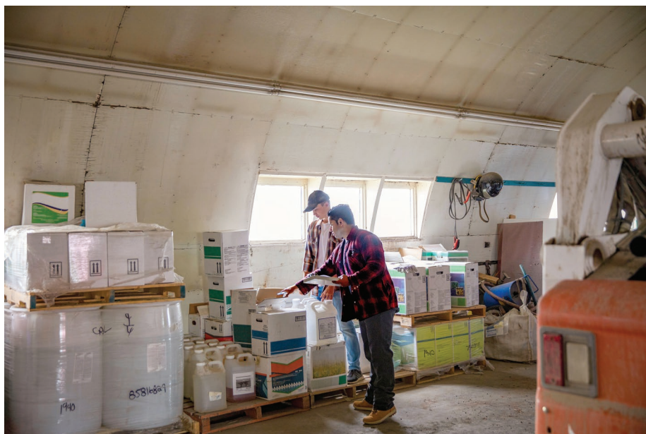
The shelf life of a biostimulant product should be considered if there may be circumstances where it is best to save the product for the following season.

five groups: (1) amino acids/protein hydrolysates, (2) sugars, (3) marine extracts/alginate, (4) humic/fulvic acids, and (5) concentrated enzymes.